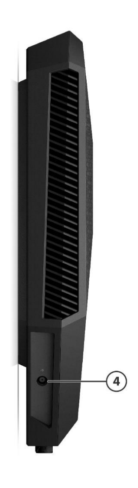
Left side view