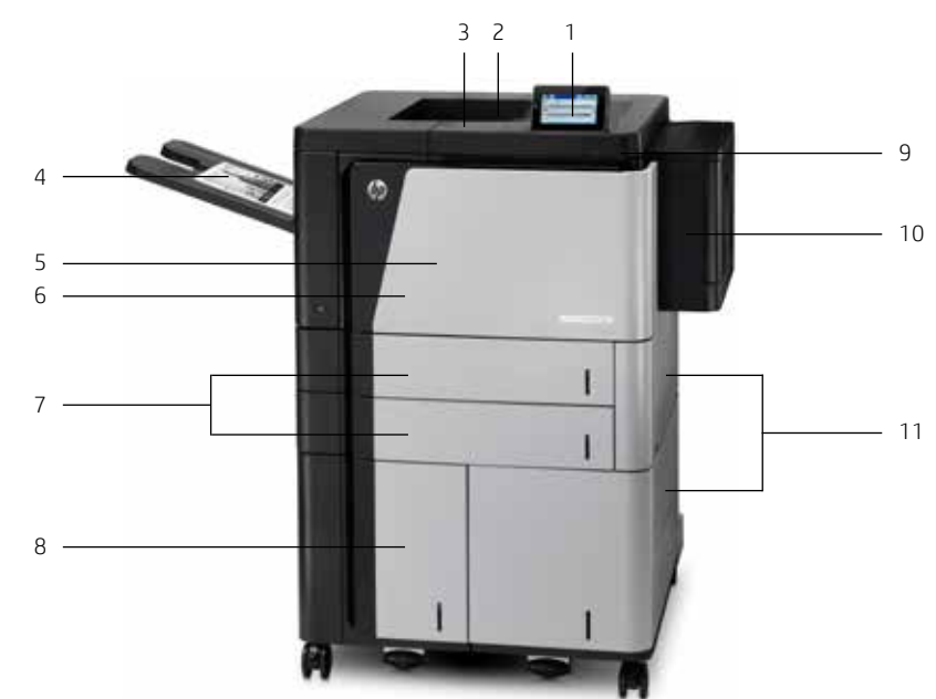
HP LaserJet Enterprise M806x+ Printer shown