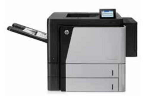
HP LaserJet Enterprise M806dn Printer

This HP LaserJet handles big print jobs fast, with extra-large input capacity and versatile paper-handling options. Mobile printing is simple with wireless direct printing and touch-to-print technology. Easy upgrades protect your investment.<sup>1, 2</sup>