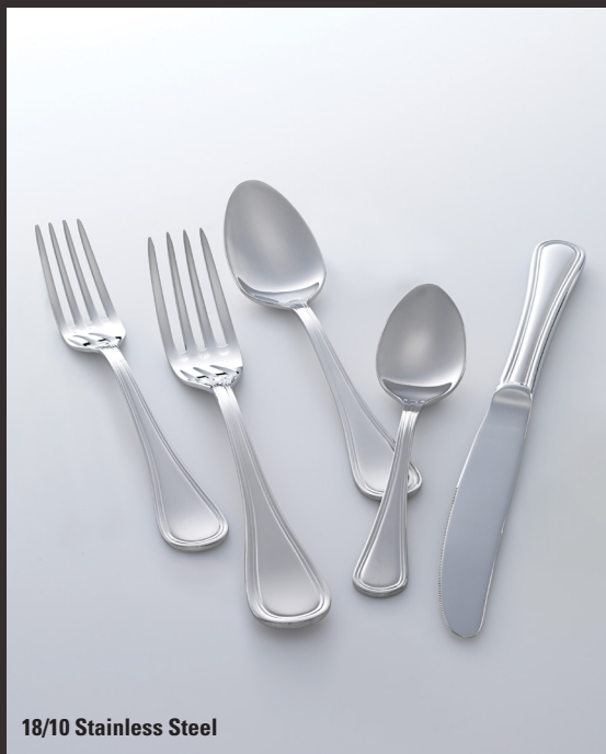
18/10 Stainless Steel