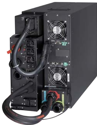
9PX 11kVA with maintenance bypass

9PX 1:1 is an Energy Star® qualified UPS