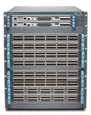
PTX10008 Packet Transport Router