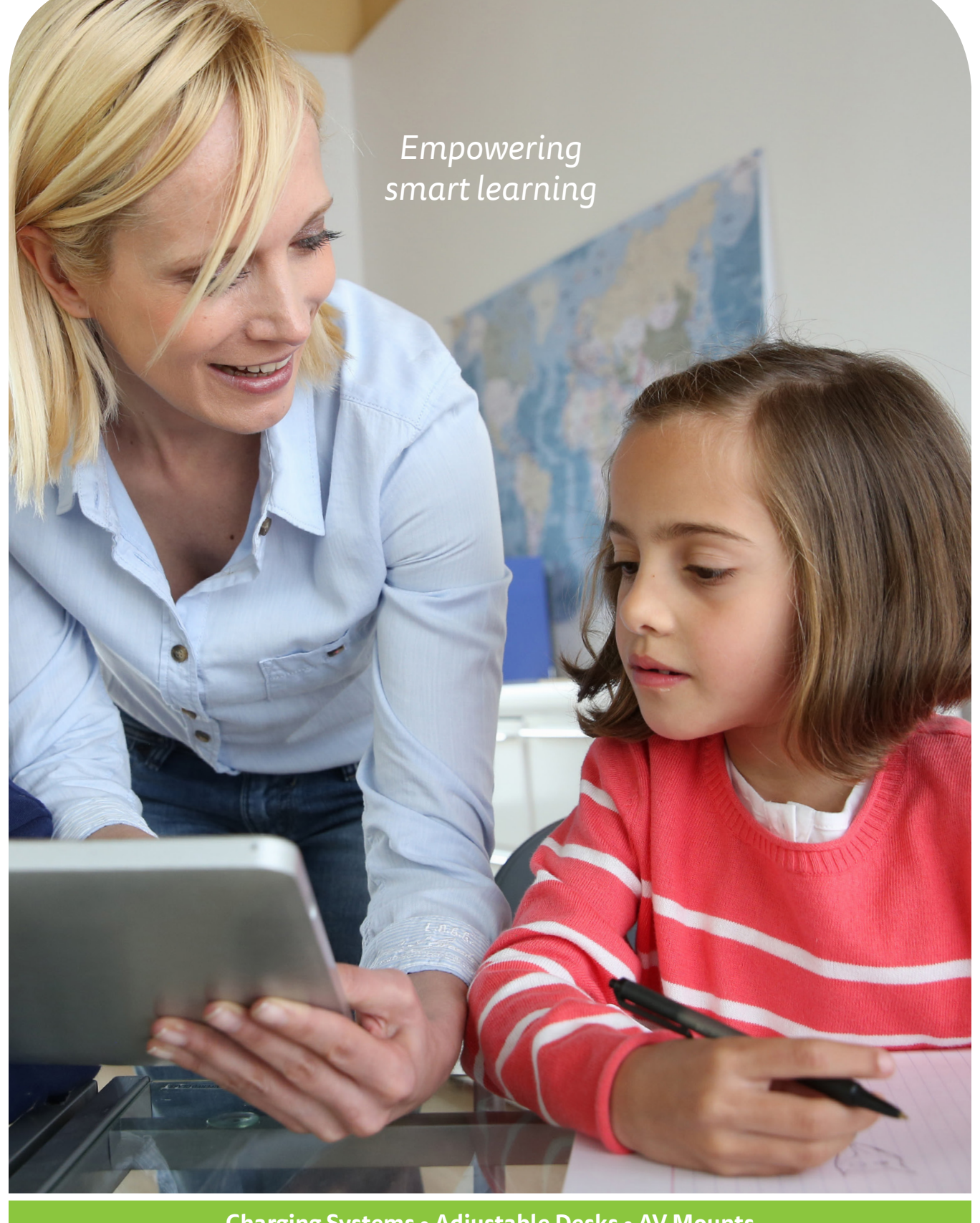
Charging Systems • Adjustable Desks • AV Mounts