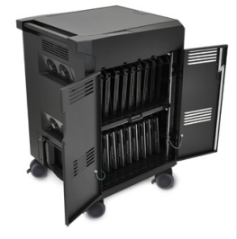
PowerShuttle Laptop Charging Cart