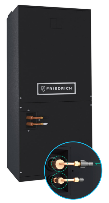
Leak Detection All Friedrich Breeze air handlers have a nitrogen charge and factory installed leakage indicators to warn against leaks caused prior to installation.

Friedrich Breeze<sup>™</sup> Ducted Mini Split Heat Pumps