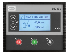
DEIF SGC 120