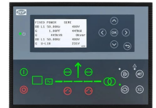
DEIF AGC 150