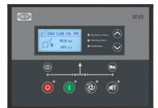
DEIF SGC 420