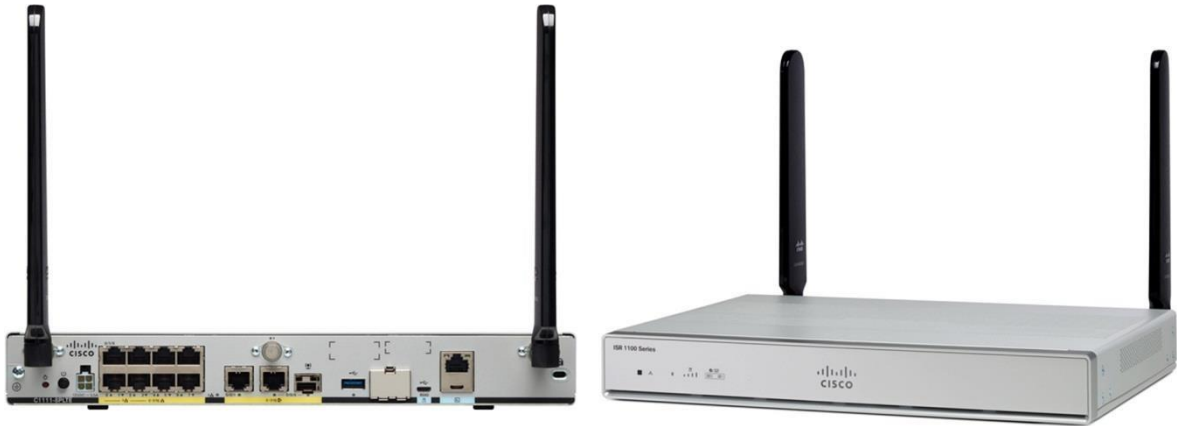
Figure 2. Cisco 1100-8P ISR with LTE advanced, back and front view