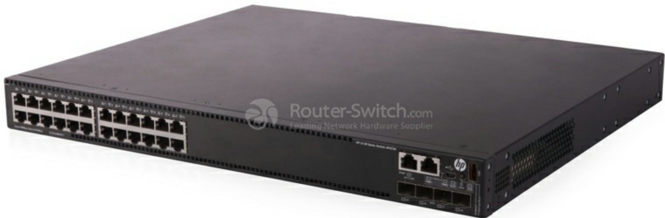
Table 1 shows the quick spec.

Figure 1 shows the appearance of HPE JH323A.