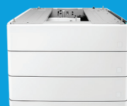
3x550-sheet tray and stand