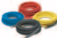
Heavy-duty, high-pressure hoses in lengths up to 150-ft.

360° Pivot and non-pivot hose reels keep hose neatly stored and shop areas safe