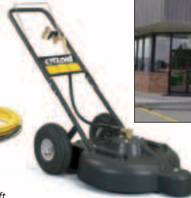
Rotary surface cleaner attaches to your pressure washer; reduces overspray and zebra striping

Telescoping wands extend to 24' to reach high places without scaffolding