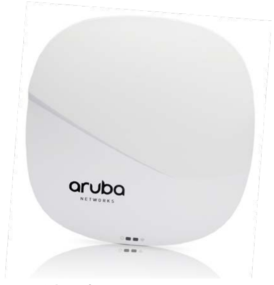
High-performance 802.11ac Wave 2

The 310 Series also has an integrated Bluetooth Aruba Beacon that simplifies the remote management of a network of large-scale battery-powered Aruba beacons while also providing advanced location and indoor way finding, and proximity-based push notification capabilities. It enables businesses to leverage mobility context to develop applications that will deliver an enhanced user experience and increase the value of the wireless network for organizations.