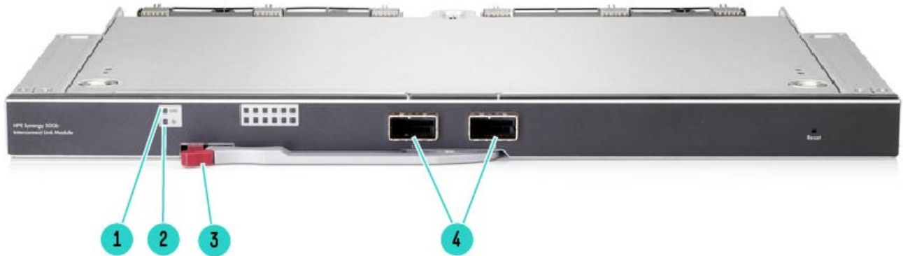
Figure 1 HPE Synergy 50Gb Interconnect Link Module

The master module contains intelligent networking capabilities that extend connectivity to frames equipped with satellite modules. This reduces the need for top of rack switches and substantially decreases cost. The reduction in components simplifies fabric management at scale while consuming fewer ports at the data center aggregation layer.