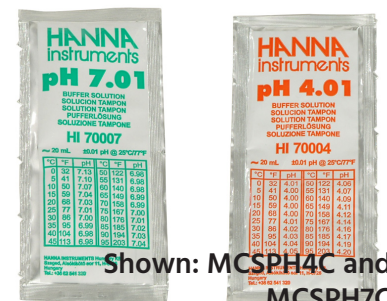
Shown: MCSPH4C and MCSPH7C