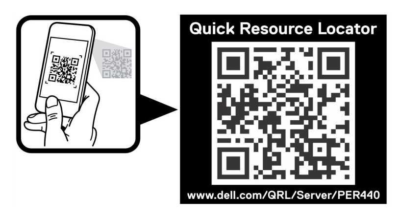
Figure 2. Quick Resource Locator for Dell EMC PowerEdge R440 system