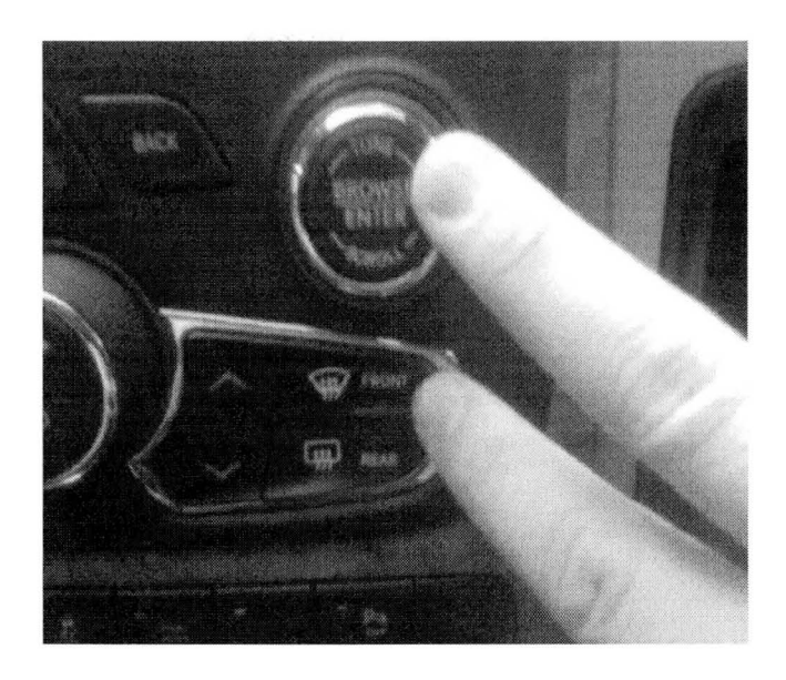
Fig. 2 Take Vehicle Out of Ship Mode

1 - Press and hold these buttons, to put the vehicle in and out of ship mode.