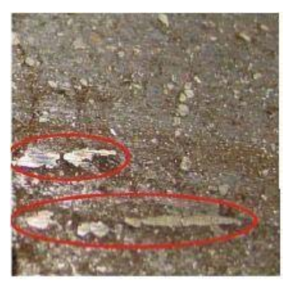
Figure 1. Metallic deposits.