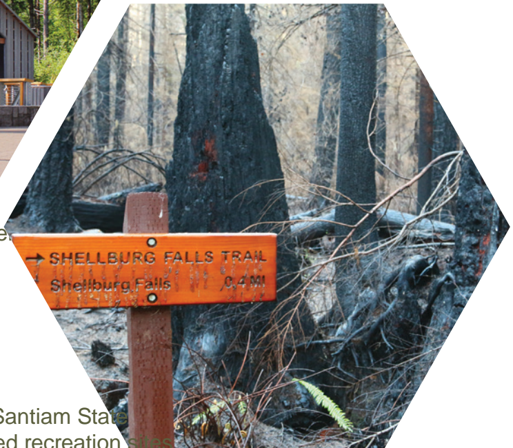
Wild re in the Santiam State Forest damaged recreation