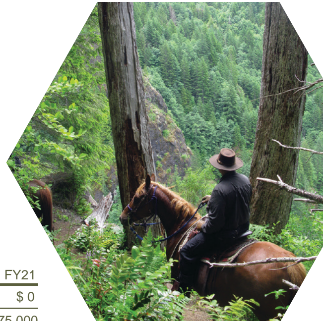
Recreating in the Tillamook State Forest