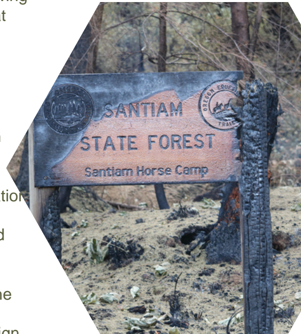
Santiam State Forest wild re damage