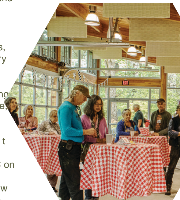
Routebeer event at the Tillamook Forest Center, September 2019