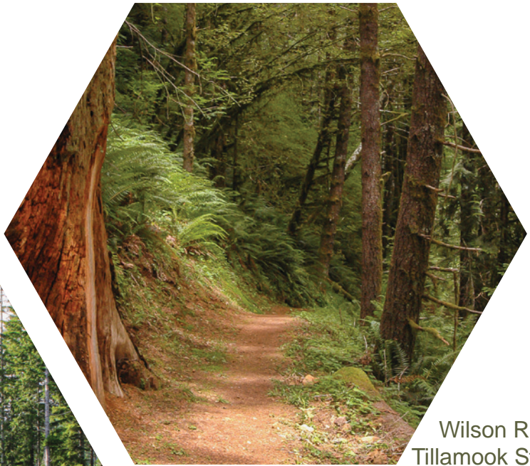
Wilson River Trail, Tillamook State Forest