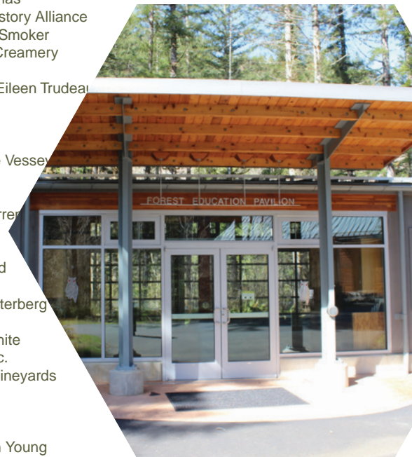
Forest Education Pavilion at the Tillamook Forest Center