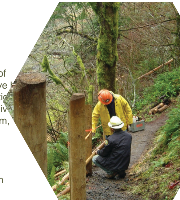
Peninsula Trail improvement in the Tillamook State Forest