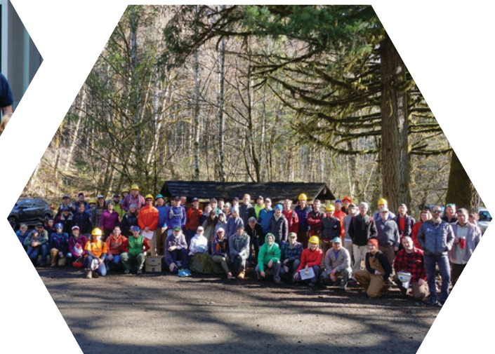
Trail volunteers make a huge difference!