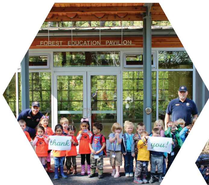
Student appreciation for the Forest Education Pavilion