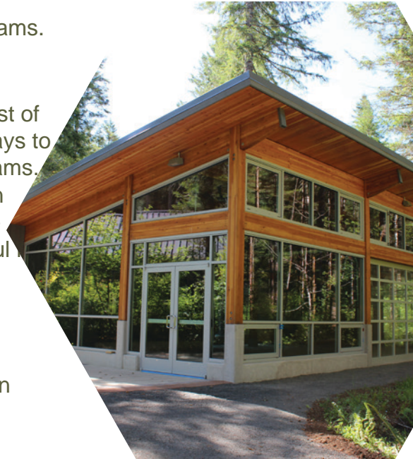
Forest Education Pavilion at the Tillamook Forest Center