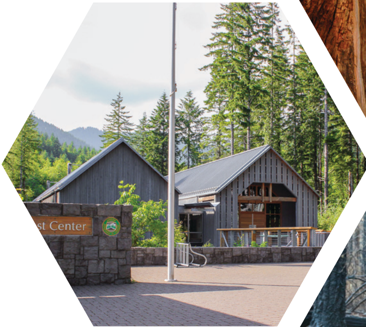
Tillamook Forest Center