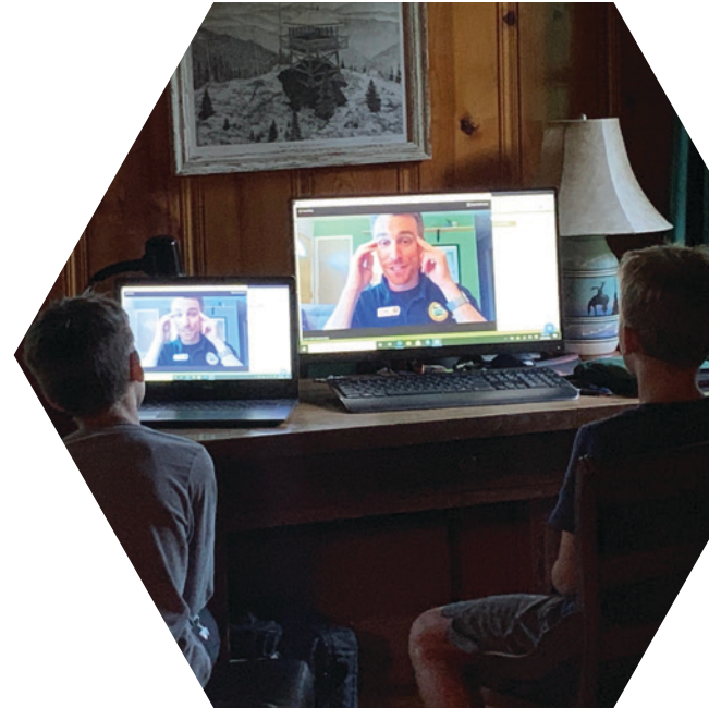
Virtual visitors participate in an online TFC program