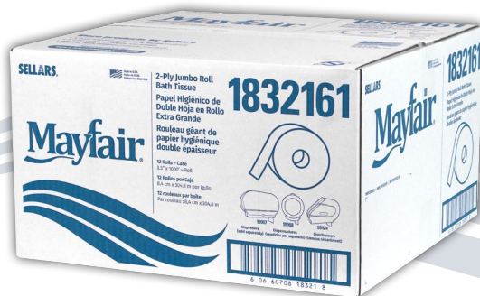
2-Ply Jumbo Roll Bath Tissue (1000') Outer Case