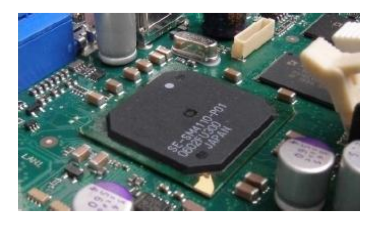
iRMC S3 – integrated Remote Management Controller

The iRMC S3 offers enhanced security functions, including 128-bit SSL encryption and efficient user authentication to ensure maximum security.