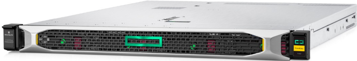
HPE StoreEasy 1460 Storage

HPE StoreEasy 1460 Storage solutions deliver multi-protocol file serving and application storage in a compact and affordable 1U rack-mount form factor that’s perfect for a small workgroup, small business, or remote office. All HPE StoreEasy 1460 models come with the operating system pre-installed on the four internal LFF drives.