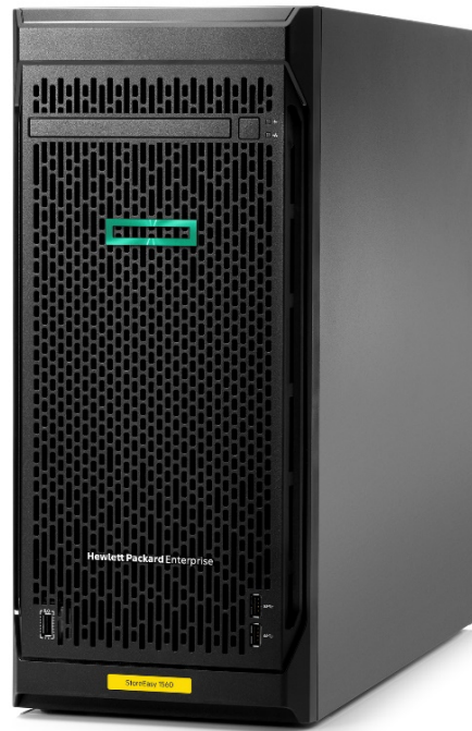
HPE StoreEasy 1560 Storage

HPE StoreEasy 1560 Storage solutions are built on a compact and affordable tower form factor package and deliver multi-protocol file serving and application storage to environments that don't have rack space, including small workgroups, small businesses, and remote offices. All HPE StoreEasy 1560 models come with the operating system pre-installed on the four internal LFF drives.