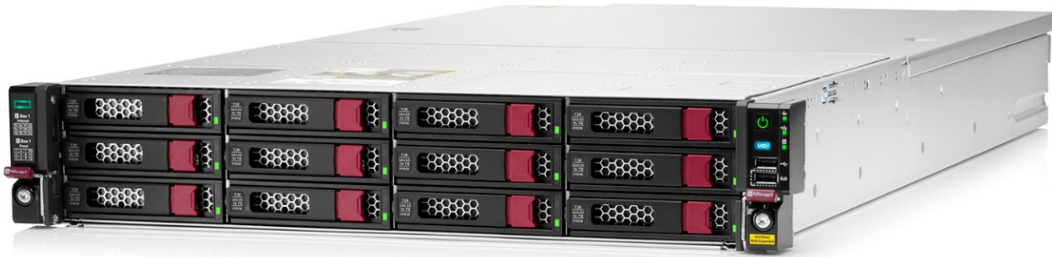
HPE StoreEasy 1660 Expanded Storage

The HPE StoreEasy 1660 Expanded Storage is a density-optimized (with 28 LFF hot-plug drive slots) 2U rack-mount form factor platform ideal for bulk file and secondary storage workloads. All StoreEasy 1660 Expanded models come with the operating system pre-installed on mirrored solid state drives.