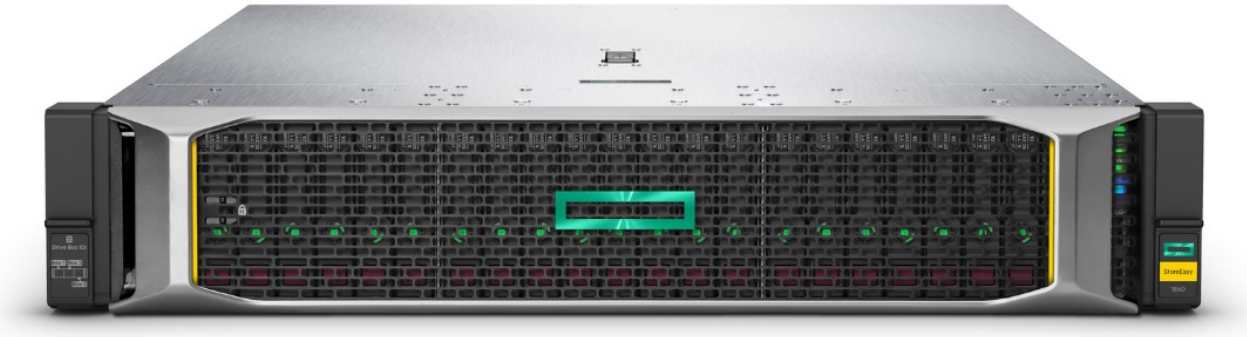
HPE StoreEasy 1860 Storage

HPE StoreEasy 1860 Storage solutions deliver enterprise-class performance (with up to 26 SFF hot-plug drive slots in a 2U rack-mount form factor) for hybrid flash configurations and latency-sensitive file share or application workloads. All HPE StoreEasy 1860 models come with the operating system pre-installed on mirrored solid state drives.