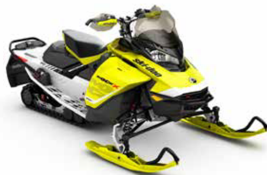
MXZ ® X 850 E-TEC shown