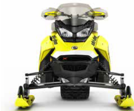
MXZ® X 850 E-TEC shown