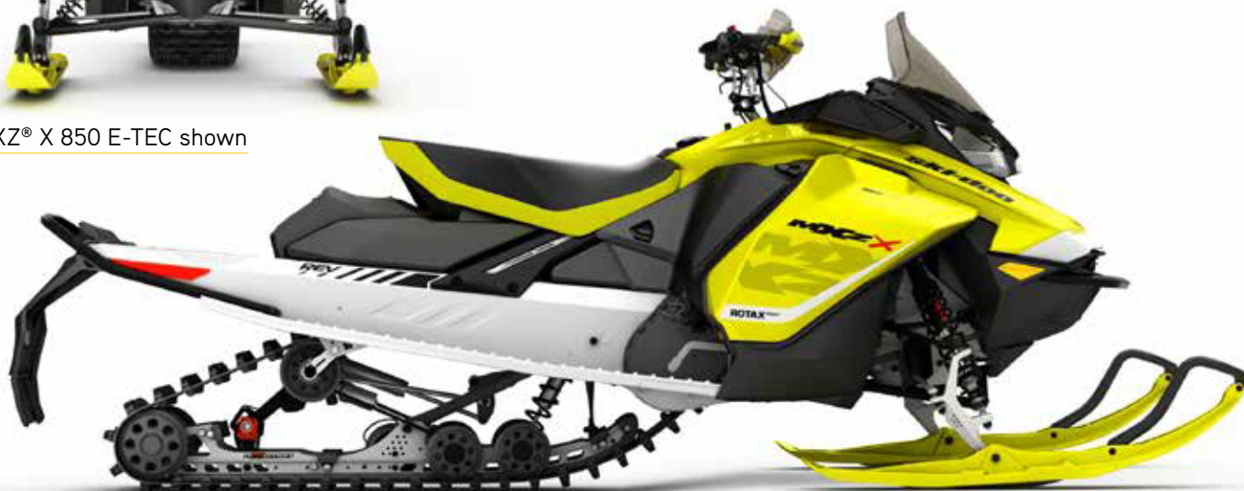
MXZ® X 850 E-TEC shown