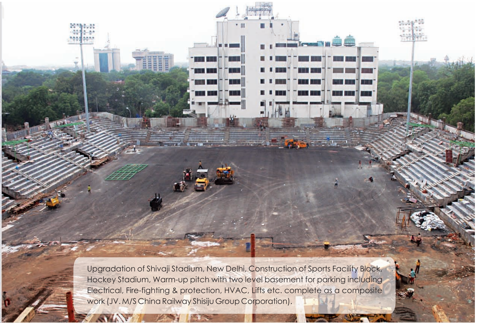
Upgradation of Shivaji Stadium, New Delhi, Construction of Sports Facility Block, Hockey Stadium, Warm-up pitch with two level basement for parking including Electrical, Fire-fighting & protection, HVAC, Lifts etc. complete as a composite work (JV. M/S China Railway Shisiju Group Corporation).