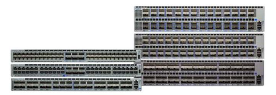
Arista 7280R Series

7280R support for 100GbE QSFP incorporates a flexible choice of interface speed including 25GbE and 50GbE providing unparalleled flexibility and the ability to seamlessly transition data centers to the next generation of Ethernet performance. The 7280R Series provide industry leading power efficiency with airflow choices for back to front, or front to back. An optional built-in SSD supports advanced logging, data captures and other services directly on the switch. Combined with Arista EOS the 7280R Series delivers advanced features for big data, cloud, virtualized and traditional designs.