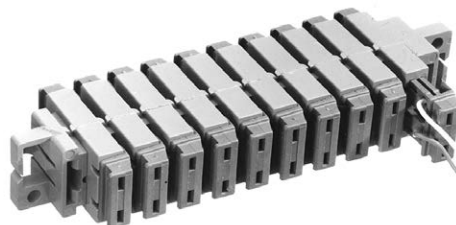
Wire Inserted into Activator