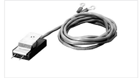
RLSTEST1 RLS One-Pair Tester