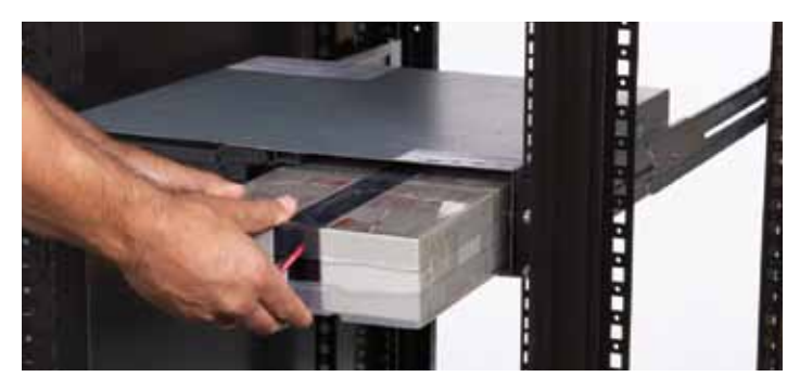
Hot-swappable internal batteries in only 2U