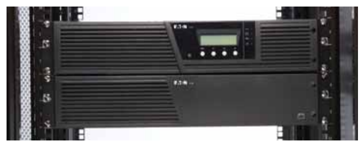
Add up to four EBMs for hours of runtime