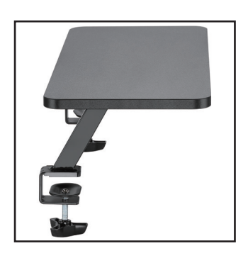
Assembling the Monitor Riser

2. Align the Screw Holes (x 2) on the Clamp Assembly with the Mounting Holes (x 2) on the bottom of the Monitor Platform . When aligning the Clamp Assembly with the Mounting Holes , the back of the Clamp Assembly should be closest to the edge of the Monitor Platform .