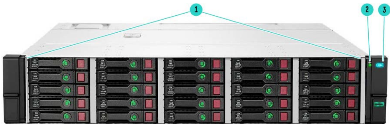
HPE D3710 Enclosure (SFF)

See the Windows Server Catalog for the latest supported configurations. Total support can grow as needed to up to 96 LFF drives or 200 SFF drives.