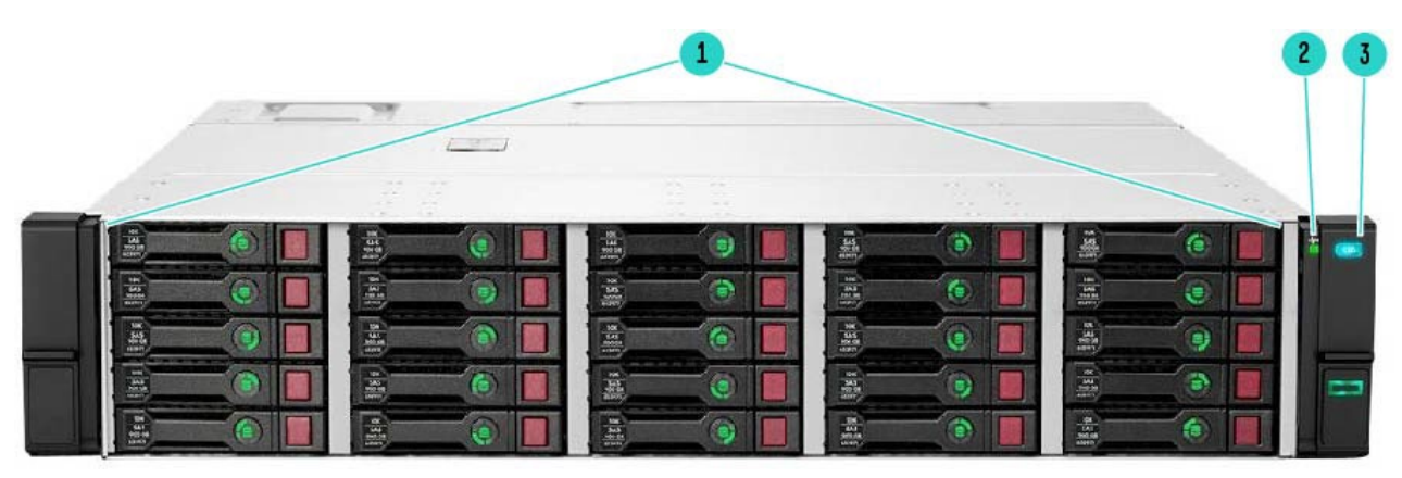
HPE D3710 Enclosure (SFF)

See the <u>Windows Server Catalog</u> for the latest supported configurations. Total support can grow as needed to up to 96 LFF drives or 200 SFF drives.