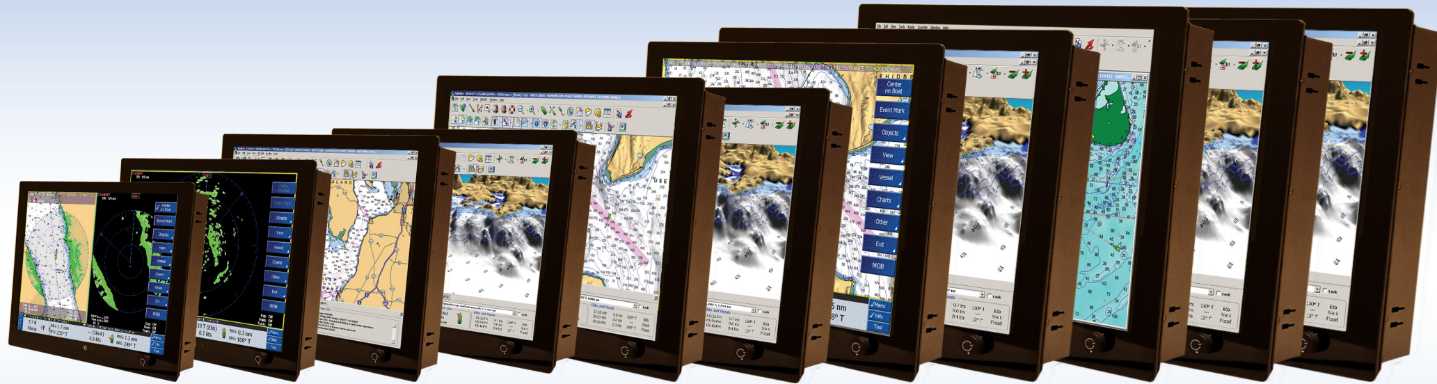
10" Display SRT/PHT-10

Sunlight Readable Touchscreen (SRT) & Pilot House Touchscreen (PHT) Displays Designed for the Industrial and Marine Industries.