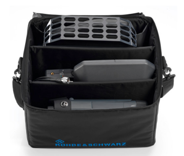
R&S®HE400Z3 transport bag (large).