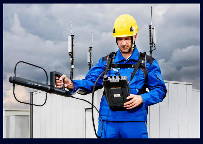
Mobile network testing and interference hunting.

Rohde & Schwarz handheld antennas in combination with a receiver or an analyzer allow users to monitor and analyze relevant signal parameters such as the frequency, spectrum occupancy, signal level and signal bandwidth.