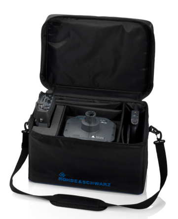
R&S®HE400Z6 transport bag suitable for R&S®HE400SHF/HE400SCB antenna module.