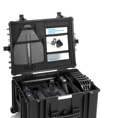
R&S*HE400Z7 transport case — accommodates antenna handle, R&S*HE400VHF/HE400UWB/HE400SHF antenna module and 15" laptop.