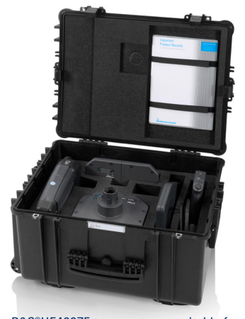
R&S®HE400Z5 transport case suitable for R&S®HE400SHF/HE400SCB antenna module.