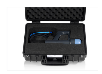
R&S®HE800-PA in R&S®HE800Z1 transport case.