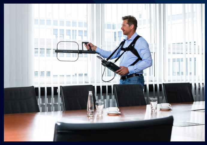
General interference hunting