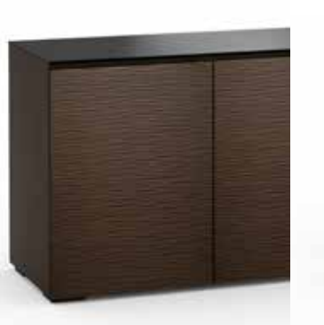
BERLIN* Wenge, Wave-Texture Doors Solid Surface, Matte Black Top