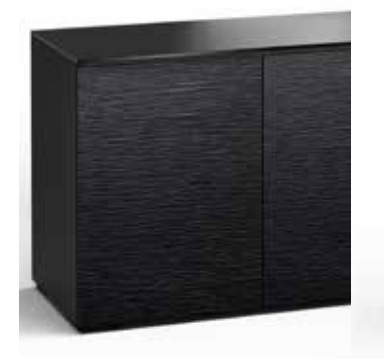
CHICAGO* Black Oak, Grass-Textured Doors Solid Surface, Matte Black Top