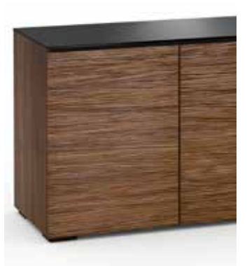
DENVER - WALNUT* Medium Walnut, Bark-Textured Doors Solid Surface, Matte Black Top