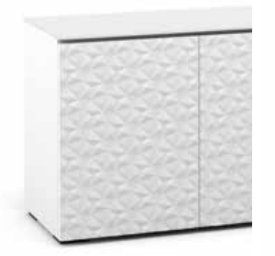
MILAN* Dimensional, Diamond Pattern, Solid Surface, Warm White Top

We select the finest materials and finishes. Choose from sleek, hand-polished, high-gloss finishes to richly textured real wood fronts or a contemporary beveled edge style with a mix of materials. If you are looking for something different or special, please contact us to discuss custom options.