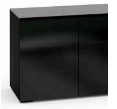
OSLO* Black Oak Sides, Black Glass Doors Solid Surface, Matte Black Top