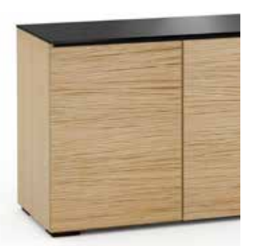
DENVER - OAK* Natural Oak, Bark-Textured Doors Solid Surface, Matte Black Top