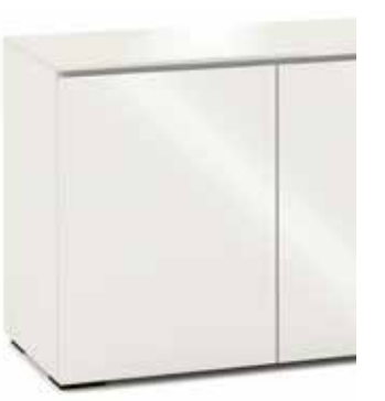
MIAMI* Gloss Warm, Solid Surface, Warm White Top