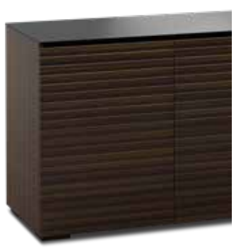
ZURICH* Opium Brown, Solid Surface, Matte Black Top