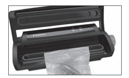
Place Bag in Vacuum Channel

As you become familiar with the unit you can minimize bag waste by inserting the bag just over the edge of the removable drip tray.