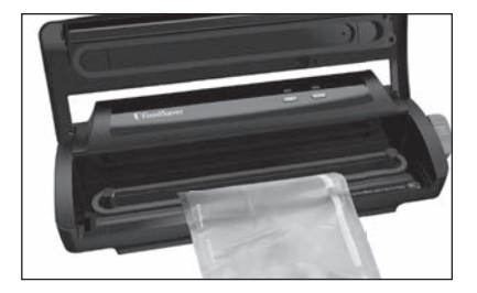
Place Bag on Sealing Strip

Now you are ready to vacuum package with your new bag (see next page).