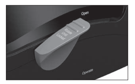
Close and Latch Lid