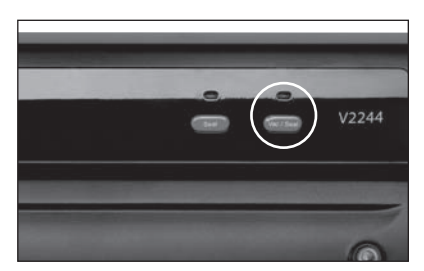
Press Vacuum & Seal Button