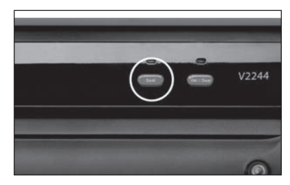
Press Seal Button