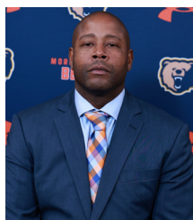
Brawley Evans Linebackers