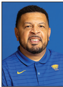
Jeff Capel Head Coach