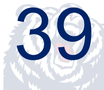
Wins during 2022 season, tying the program record