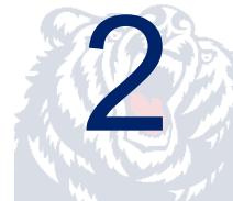
NCAA Tournament Appearances