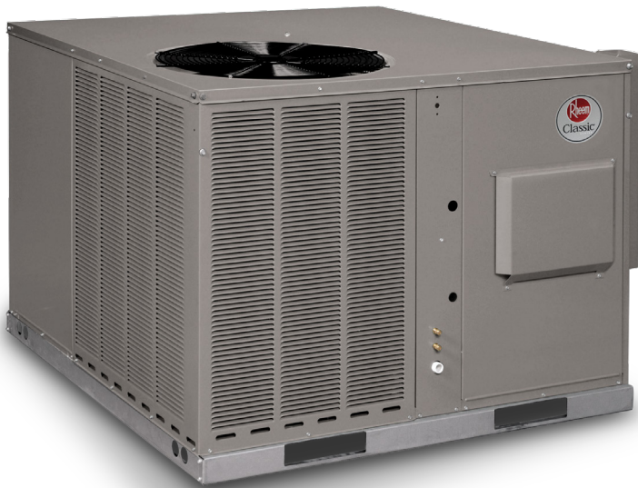
Endeavor™ Line Classic® Series iR Packaged Gas Electric