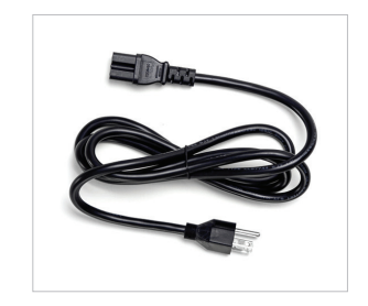
Power Cord (sold separately)