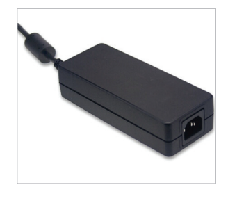
50W Power Adapter Spare