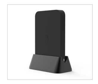
Desk Stand (sold separately)