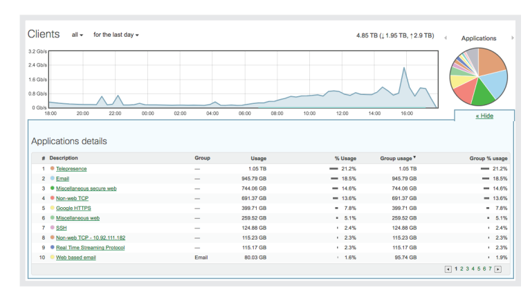
APPLICATION VISIBILITY AND CONTROL

The Z-Series includes an integrated layer 7 packet inspection, classification, and control engine, enabling you to set QoS policies based on traffic type. Prioritize your mission critical applications like VoIP or remote desktop, while setting limits on recreational traffic, e.g., peer-to-peer and video streaming.