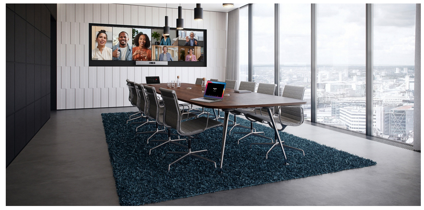
Figure 1. The Cisco Room Kit EQ in a conference room with the Quad Camera, the table-stand Room Navigator, and the Cisco Microphone Array (Cisco Table Microphone Pro)

The Room Kit EQ provides optionality and extensibility with a highly modular setup to easily add touch controllers, cameras, speakers, microphones, and other room peripherals – easing the configuration and scaling of complex, multi-component audiovisual environments. This solution is rich in functionality and experience yet easy to deploy, maintain, and scale to your workspaces – and comes with unified cloud device management and workspace analytics in Control Hub.