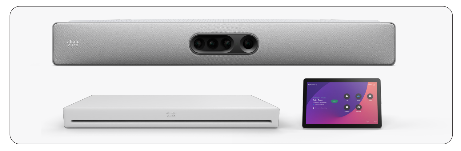
Figure 2. Main components of the Cisco Room EQ bundle: Cisco Codec EQ, Cisco Quad Camera, and the Cisco Room Navigator touch controller