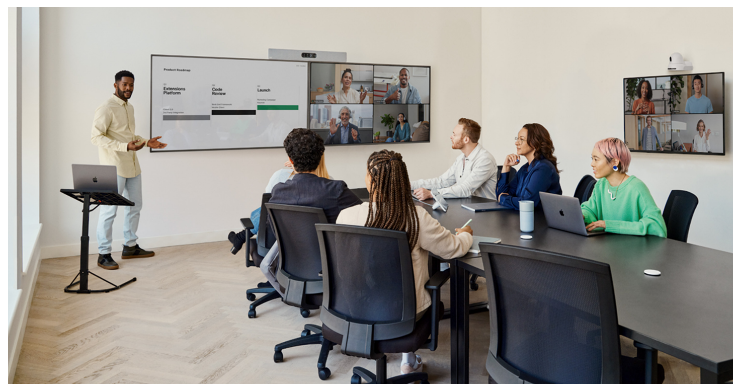
Figure 3. Cisco Room Kit EQ in a large training room featuring the Quad Camera, the PTZ 4K Camera, the Room Navigator touch controller, and Cisco table microphones