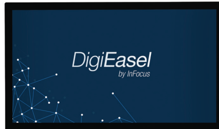
DigiEasel works in either portrait or landscape mode.

* Check with your manufacturer for Miracast or AirPlay compatibility with the specific version of your device's OS.