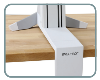
DESK CLAMP ATTACHES TO SURFACE EDGE .47-2.4" (1,2-6 CM) THICK