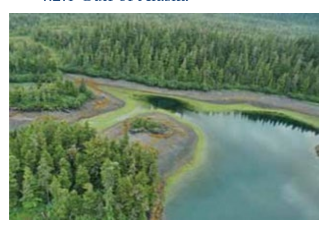
Figure 5. Eelgrass ( Zostera marina ) in Prince William Sound. Published in Coastal Impressions , A Photographic Journey along Alaska's Gulf Coast ; A.P.J., 2012.

The GOA stretches west from the Alaska Peninsula near Kodiak Island to the southern tip of Prince of Wales Island. Its northern boundary is the coast of Alaska and the southern extent is a line from the southern end of Kodiak Island to the Dixon Entrance. It includes Cook Inlet, Prince William Sound, the Copper River Delta and the 400-mile long Alexander Archipelago. In southeast Alaska, the Alexander Archipelago has over 2,900 estuaries encompassing a total surface area of 30,721 km<sup>2</sup> (11,861 mi<sup>2</sup>) (Albert and Schoen 2007). At 1,181 hectare (2,900 acres), the Stikine River Delta is the largest of these estuaries. The GOA includes two large estuary systems: Cook Inlet, which is