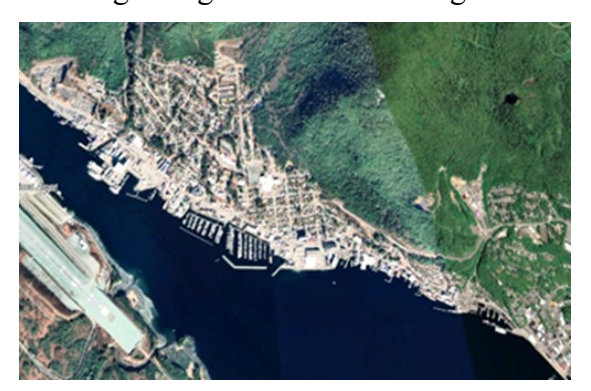
Figure 8. Satellite image of shoreline coastal development, generated using Google Earth Pro.

An increase in the number and size of operating vessels can cause more erosive wave and surge effects on shorelines. Vessel wakes can cause a significant increase in shoreline erosion, deteriorating wetland habitat, and increase water turbidity. Vessel prop wash can also damage aquatic vegetation and disturb sediments, which may increase turbidity and suspend contaminants (Klein 1997, Warrington 1999). When anchored in shallow nearshore waters, mooring buoys can drag the anchor chain across the bottom (anchor sweep), destroying submerged vegetation and creating a circular scour hole (Walker et al. 1989).