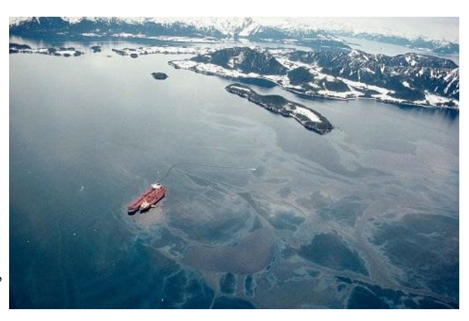
Figure 9. Aerial photograph of the oil tanker Exxon Valdez, circa March 1989.

One such gas leak occurred in Cook Inlet in 2021, when aging infrastructure from an oil platforms natural gas pipeline ruptured leaking between 5,947 to 9,203 m<sup>3</sup>(210,000 to 325,000 ft<sup>3</sup>) of natural gas (98.67 percent methane and other hydrocarbons) per day. The leak was discovered on February 7, 2017, and before coming under control was believed to have released 235,030 m<sup>3</sup> (8.3 million ft<sup>3</sup>) of natural gas<sup>41</sup>. Since then there were several other leaks of lesser volumes, all more readily put under control.