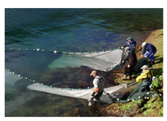
Figure 6. Scientists from Ted Stevens Marine Research Institute conducting nearshore Surveys.