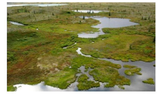
Figure 2. Wetland, pond, stream complex; headwaters upstream of the confluence of the North and South fork Koktuli River.

Headwater streams provide habitat complexity, increased prey availability, and refuge from predation (Meyer et al. 2007, Whigham et al. 2012). In Alaska, headwater streams are abundant and can be an important spawning and rearing habitat for juvenile salmonids (Woody and O'Neal 2010, Copeland et al. 2014). Food webs in headwater reaches are reliant on terrestrial subsidies from invertebrates, riparian areas, and instream nutrients (Piccolo and Wipfli 2002, Wipfli and Gregovich 2002, Walker et al. 2012).