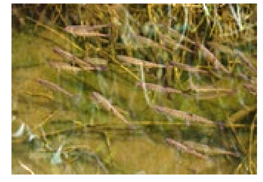
Figure 3. Salmon parr found during surveys of headwater tributaries in the upstream of the confluence of the North and South fork of the Koktuli River.

Absent data, it is best to take a precautionary approach when determining if headwater tributaries in Alaska support anadromous salmon or not. For example, many upper reaches within watersheds south of the Brooks Range still require surveys and mapping to determine