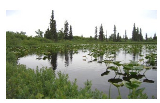
Figure 1. Denslow Lake, Chuitna watershed.

Snowmelt and rainfall saturate the Alaskan landscape, forming extensive freshwater wetland areas ranging from lowlands and depressions to hillsides and slopes (Hall et al. 1994). Alaska's wetlands occupy approximately 43 percent or 690,000 km² (266,410 mi²) of the state's 1.7 million km² (663,267 mi²) surface area (Dahl 1990). The majority of Alaska's wetlands are in the interior, Arctic, and western regions of the state. Only 42 percent of Alaska's wetlands are mapped (USFWS 2013).