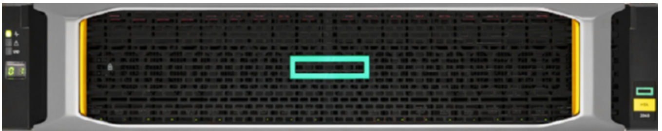
HPE MSA 2060 Storage

The HPE MSA 2060 is a flash-ready hybrid storage system designed to deliver hands-free, affordable application acceleration for small and remote office deployments. Don't let the low cost fool you. It gives you the combination of simplicity, flexibility, and advanced features you may not expect in an entry-priced array. Start small and scale as needed with any combination of solid state drives (SSDs), high-performance Enterprise SAS HDDs, or lower-cost Midline SAS HDDs. With the ability to deliver 395,000 IOPS, the new MSA 2060 is up to 80% faster than its prior generation with ample horsepower for even the most demanding workloads.