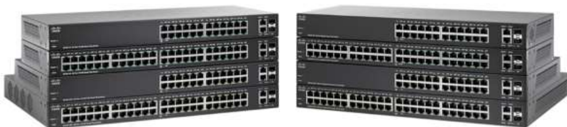
Figure 1. Cisco 220 Series Smart Switches

For businesses requiring high performance, security, and manageability from network switches, fully managed switches are an excellent choice. However, they typically come with high price tags. Smart switches provide the right level of network features and capabilities for growing businesses at lower prices, so you have more dollars to invest where they're most needed.