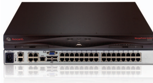
MergePoint Unity 32-port dual AC appliance