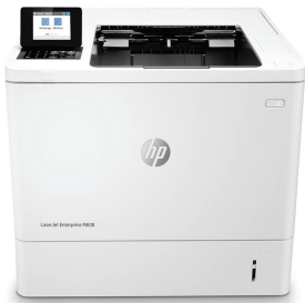
HP LaserJet Enterprise M608dn