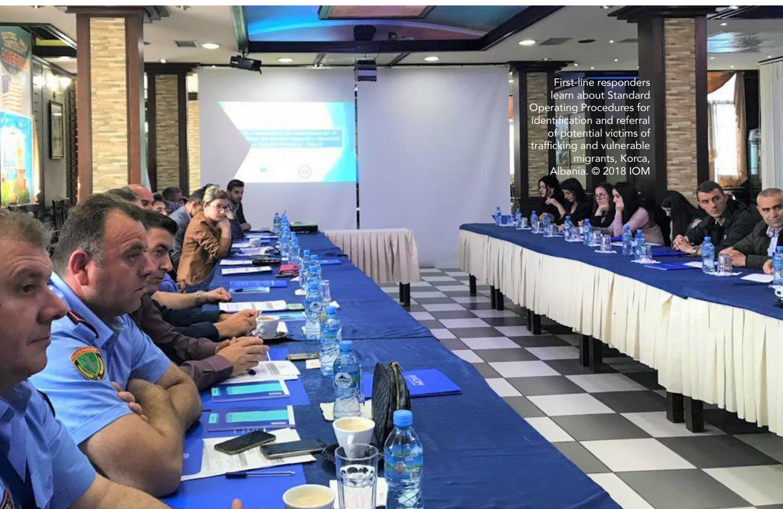
First-line responders learn about Standard Operating Procedures for identification and referral of potential victims of trafficking and vulnerable migrants, Korca, Albania.

Transfer knowledge and skills of project staff: The RMCBP in the region has high expertise to address vulnerable migrants' needs. These human resources could be further shared with government interlocutors and local NGOs that are continuing their programming.