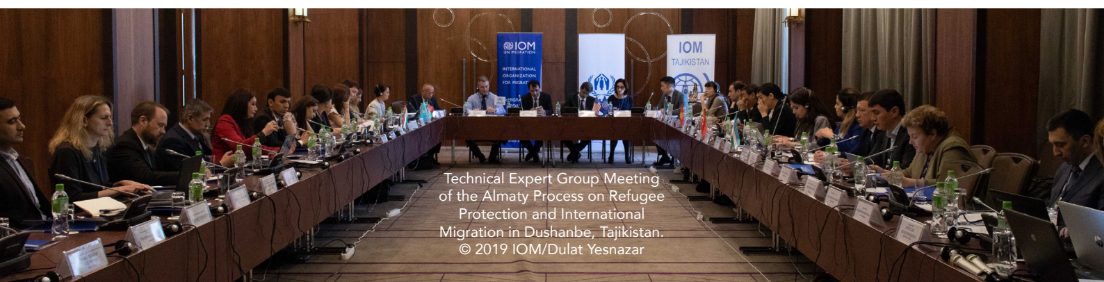
Technical Expert Group Meeting of the Almaty Process on Refugee Protection and International Migration in Dushanbe, Tajikistan.

ToT to enhance the capacity of migrant transit centers in key migration corridors in South-East and Central Asia remains a gap in responding to fast-changing migration challenges. The Cambodian Government requested PRM support for the transition center in Poipet (Cambodia) through engagement of IOM. Myanmar’s Department of Rehabilitation (Ministry of Social Welfare, Relief and Resettlement) requires resources and technical expertise, including monitoring and research skills. Future activities and associated funding are recommended to meet these needs and build on program/project achievements to date.