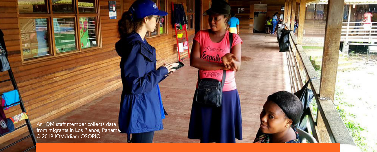
An IOM staff member collects data from migrants in Los Planos, Panama.