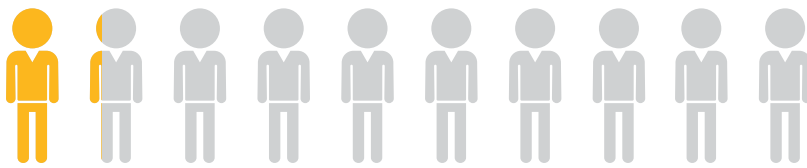
Figure 1. Number of beneficiaries who received training (October 2018 – September 2019)*