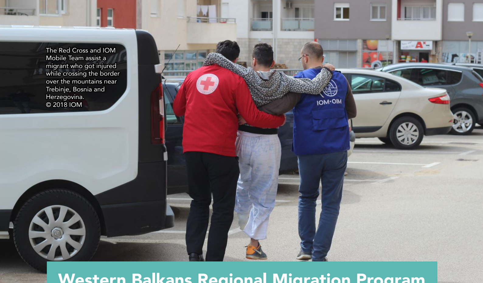
The Red Cross and IOM Mobile Team assist a migrant who got injured while crossing the border over the mountains near Trebinje, Bosnia and Herzegovina.