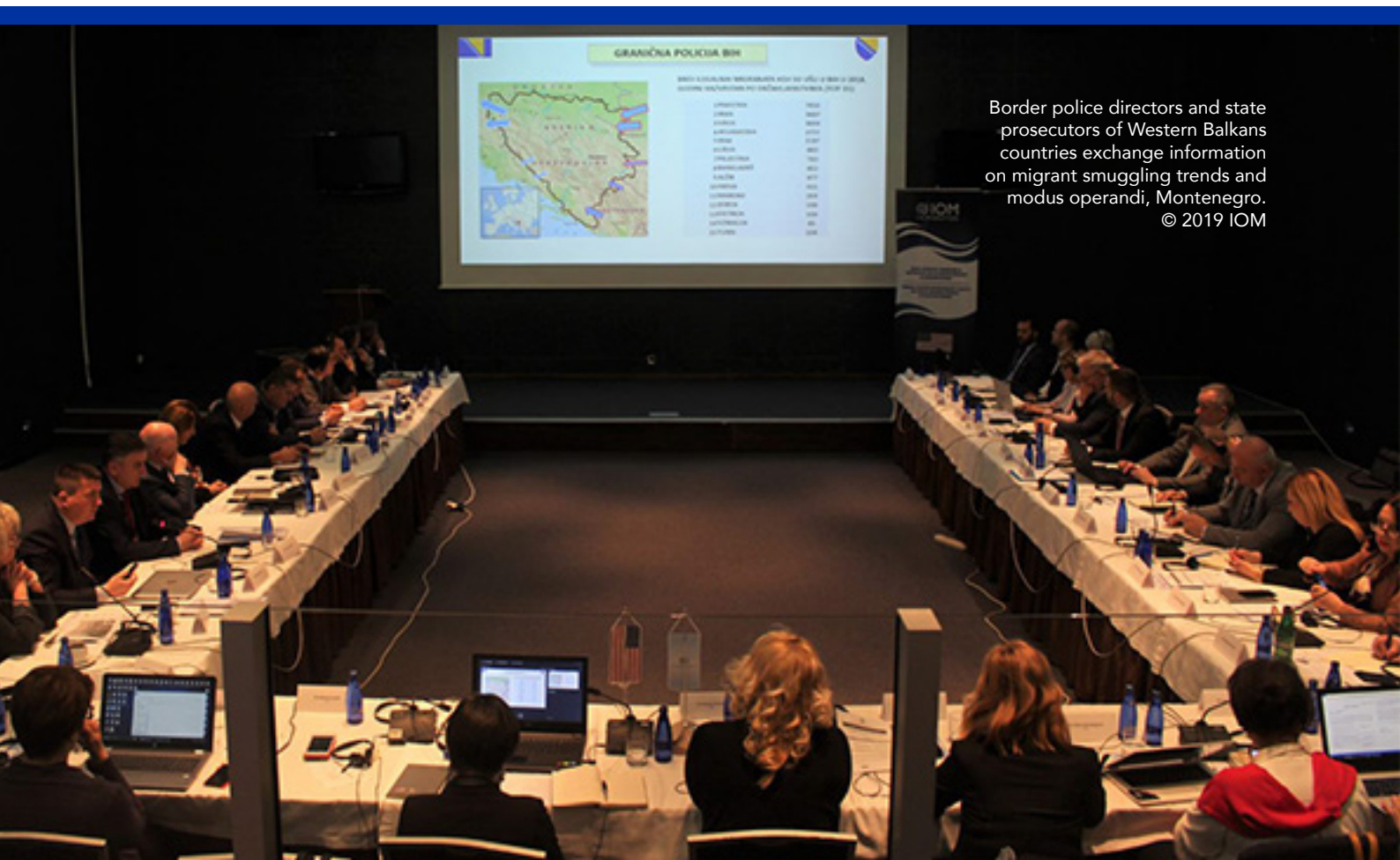
Border police directors and state prosecutors of Western Balkans countries exchange information on migrant smuggling trends and modus operandi, Montenegro.

The map on the cover is for illustration purposes only. The boundaries and names shown and the designations used on this map do not imply official endorsement or acceptance by the International Organization for Migration.