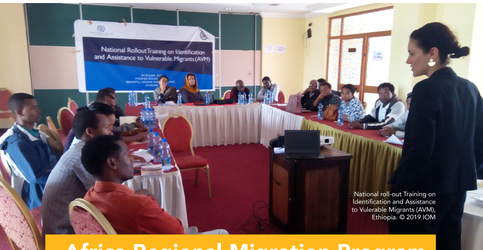
National roll-out Training on Identification and Assistance to Vulnerable Migrants (AVM), Ethiopia.