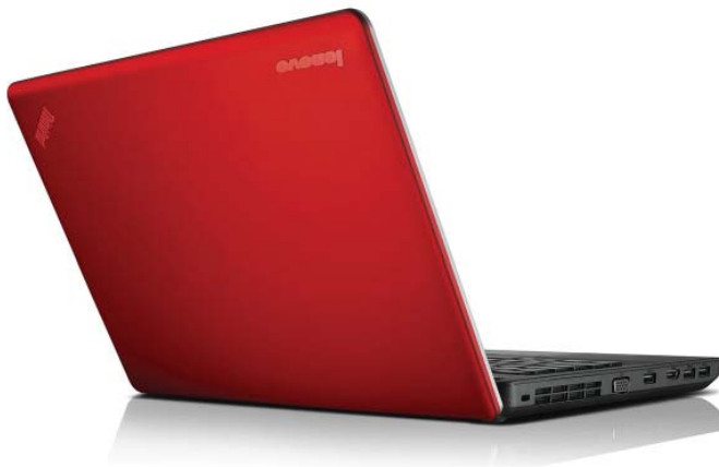
Lenovo ThinkPad Edge E430