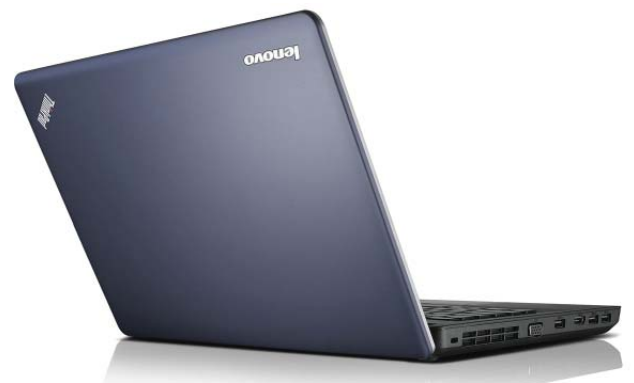
Lenovo ThinkPad Edge E430