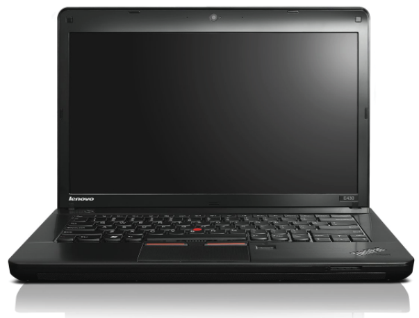
Lenovo ThinkPad Edge E430