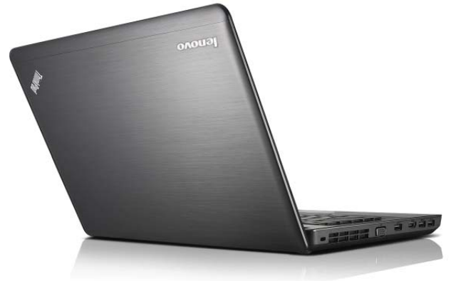
Lenovo ThinkPad Edge E430