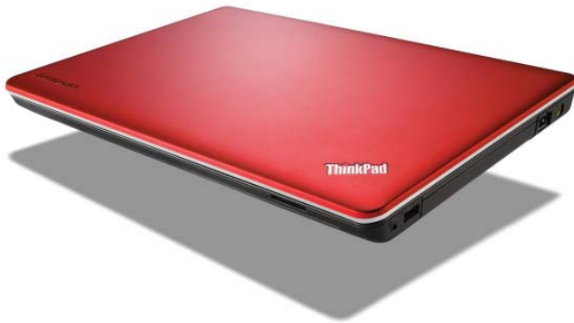
Lenovo® ThinkPad Edge E430