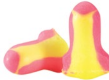
Laser Lite® Highly visible protection

NRR 33 MAX1-USA MAX30-USA CAN A(L) uncorded corded