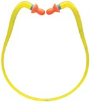
QB1® HYG Inner-aural protection

An alternative for those who work in intermittent noise or for managers and visitors who move in and out of noisy areas.