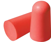
X-TREME® Tapered design for comfort

NRR 32 LL-1 LL-30 CAN A(L) uncorded corded