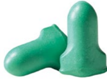
Max Lite® Low pressure foam for comfort

NRR 33 MAX-1 MAX-30 CAN A(L) uncorded corded