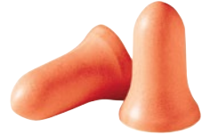
Max Small® Comfort for smaller ear canals

NRR 30 LPF-1 LPF-30 CAN A(L) uncorded corded